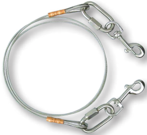
Arrangement for flag size 6' x 10' or smaller